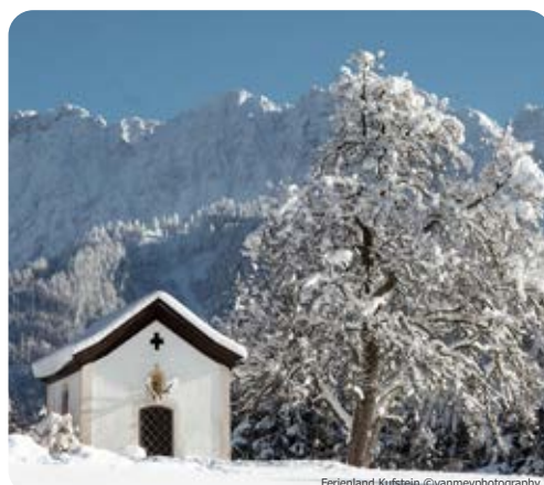
Ferienland Kufstein