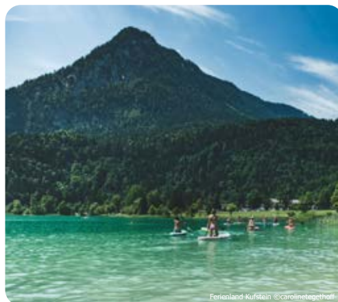
Ferienland Kufstein