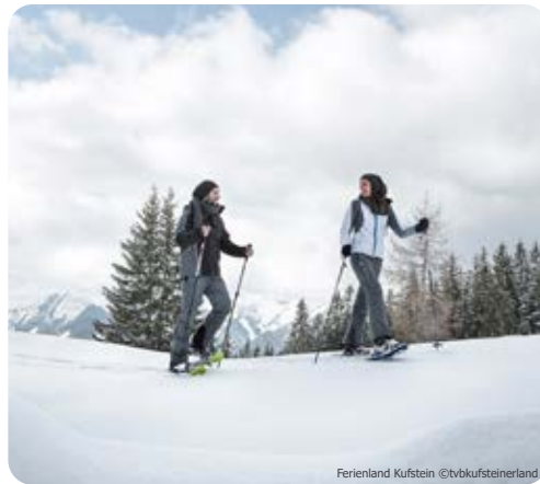
Ferienland Kufstein